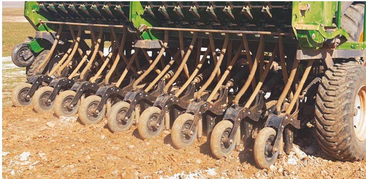
PLANTING UNIT OPERATION