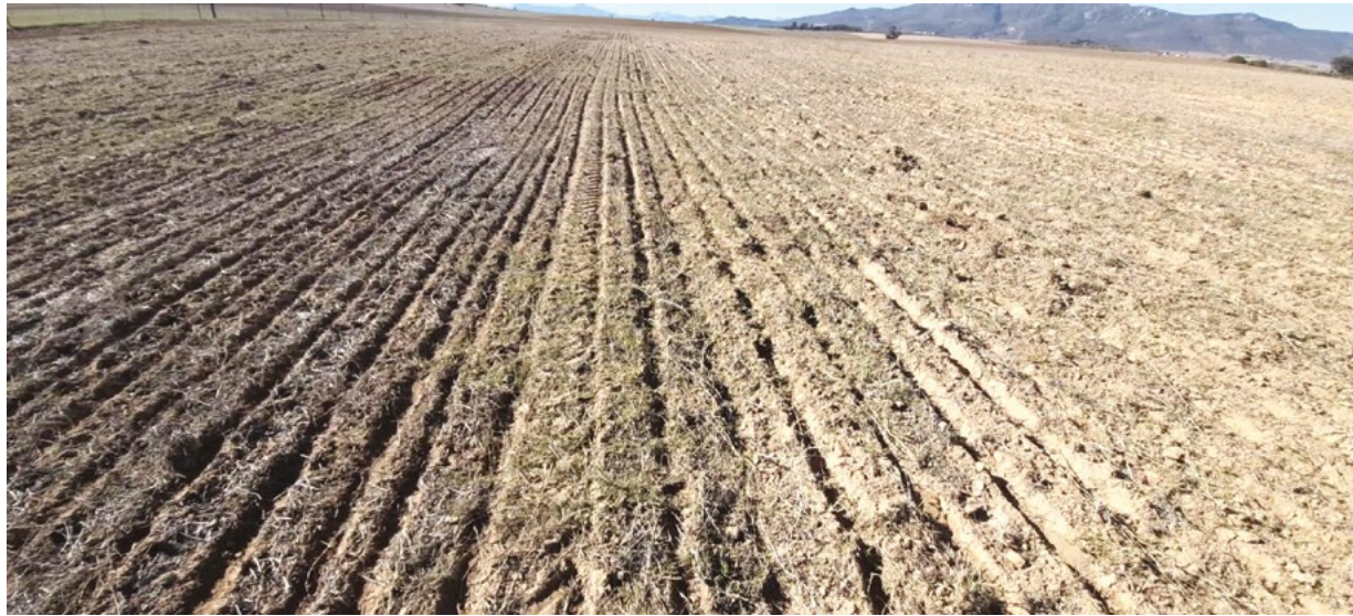
ACCURATE SEED FERTILISER DEPTH CONTROL